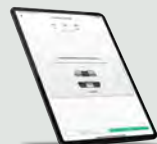
KardiaStation Application for recording an ECG with KardiaMobile 6L