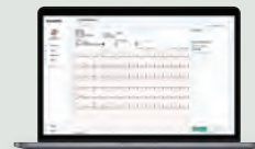
KardiaPro Web-based portal to access ECGs and QT results